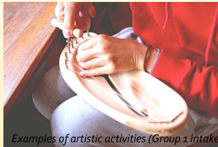
Examples of artistic activities (Group 1 intake)