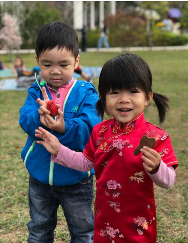
Chinese New Year Celebrations

We celebrate a wide variety of festivals throughout the year, incorporating the wide range of nationalities and cultures that are represented in school. Our main festivals include Christmas, Chinese New Year, Easter, May Day and Lantern Festival. We also enjoy whole school outings, including a picnic on the beach and visit to gardens and parks. The seasons and festivals are celebrated through story, craft, singing and movement.